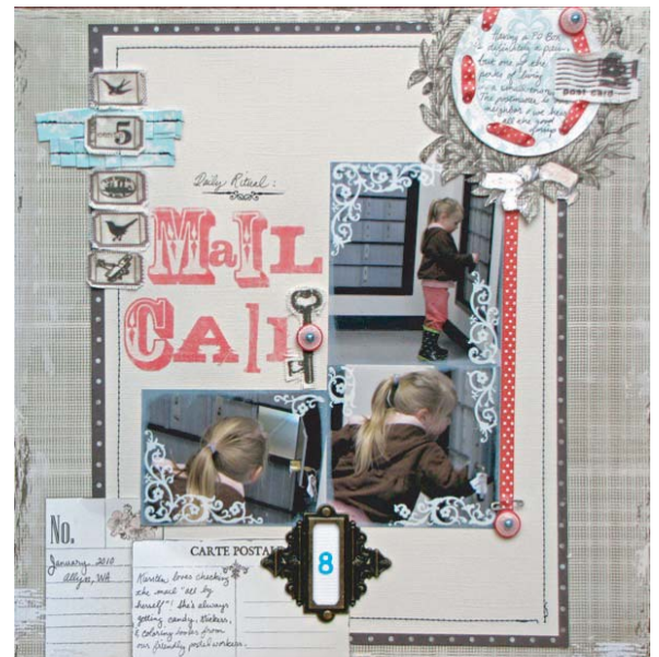
12 x 12 by Carole