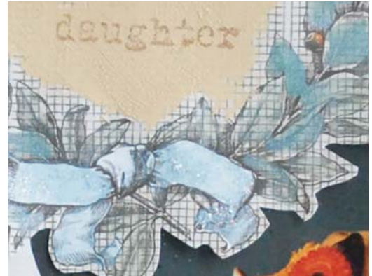
Paint on patterned paper with Blingz.