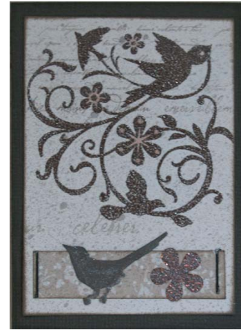
ASC