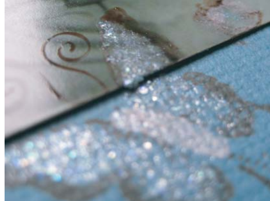
Paint on non-porous surfaces such as photos with Shimmerz and Blingz.